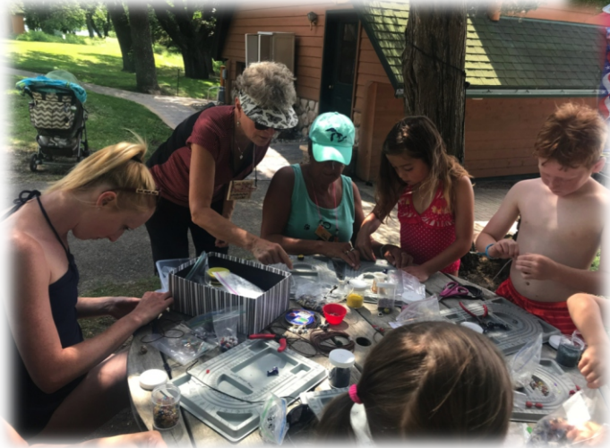
See you soon!