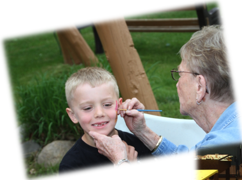
Summer fun with Camp Knutson campers, staff and volunteers!