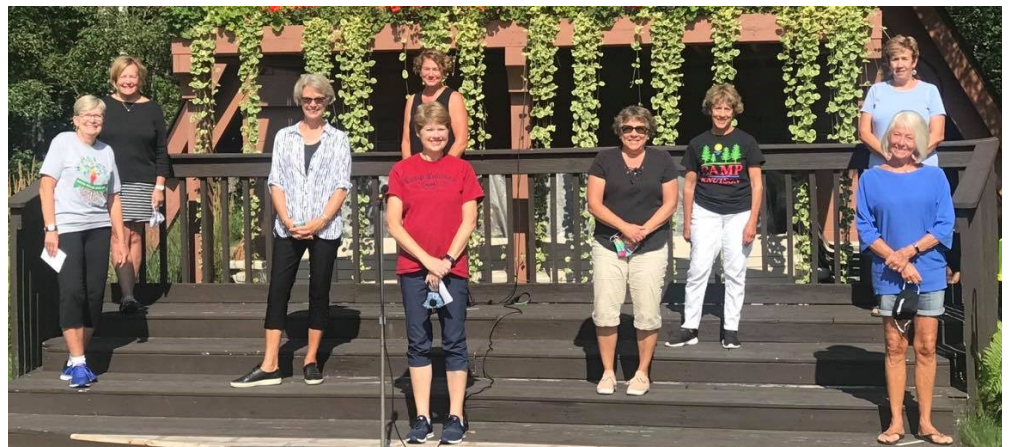
2020—2021 Volunteer Board Members

Camp Knutson 11148 Manhattan Point Blvd Crosslake, MN 56442 Phone: 218-543-4232